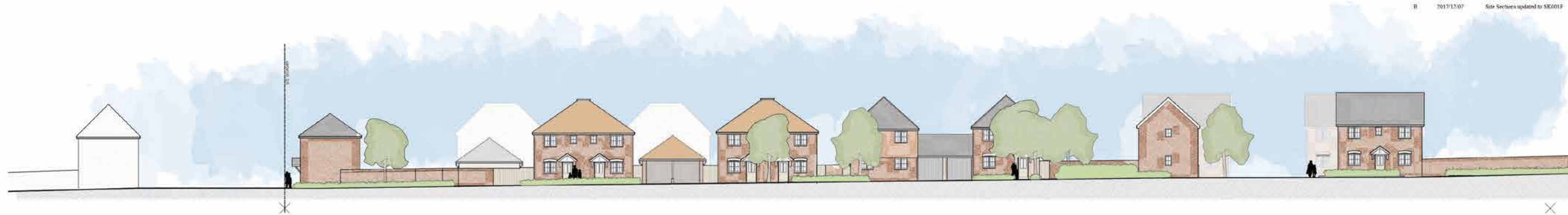
Section A-A Scale 1:200