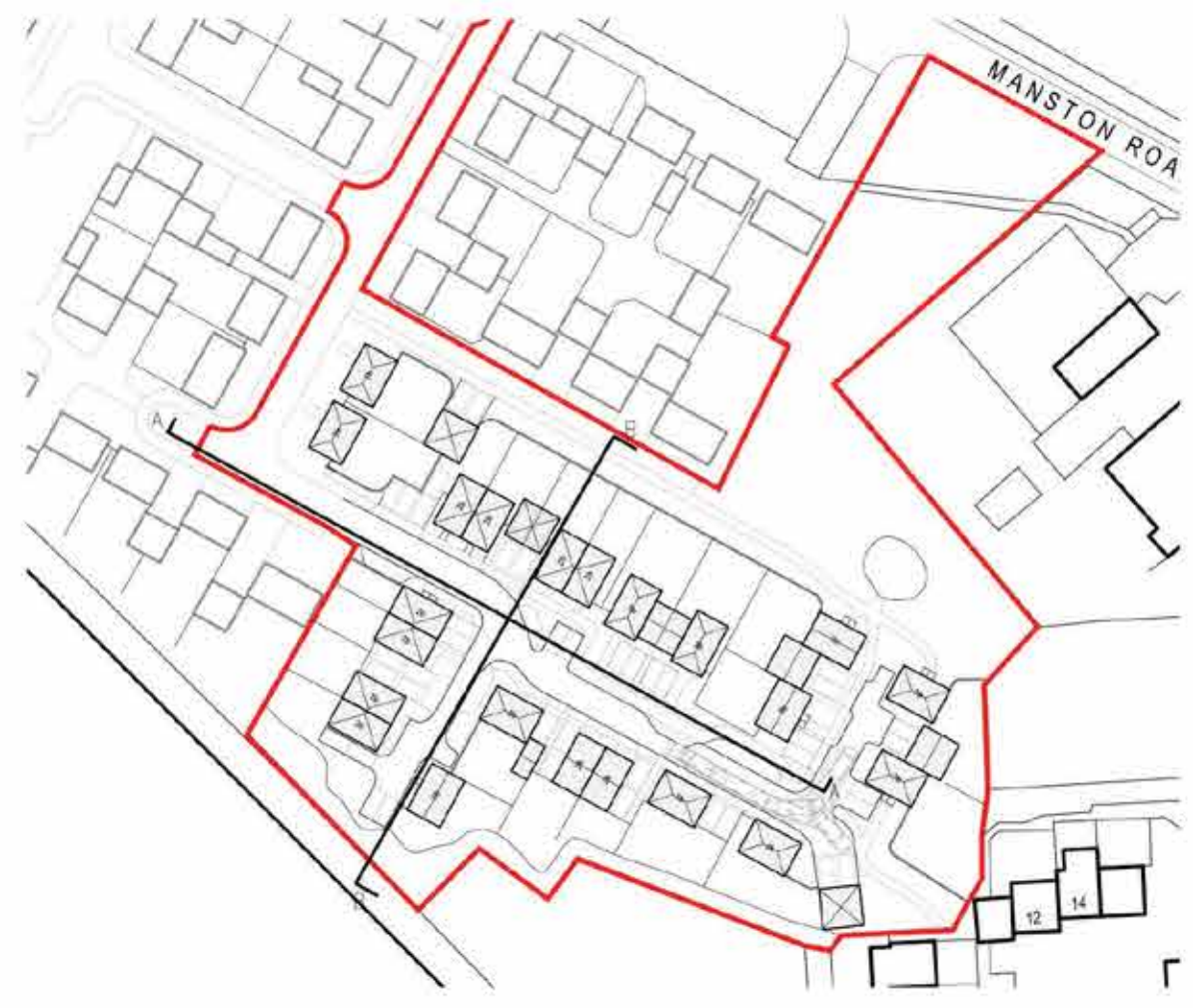
Site Plan Scale NTS