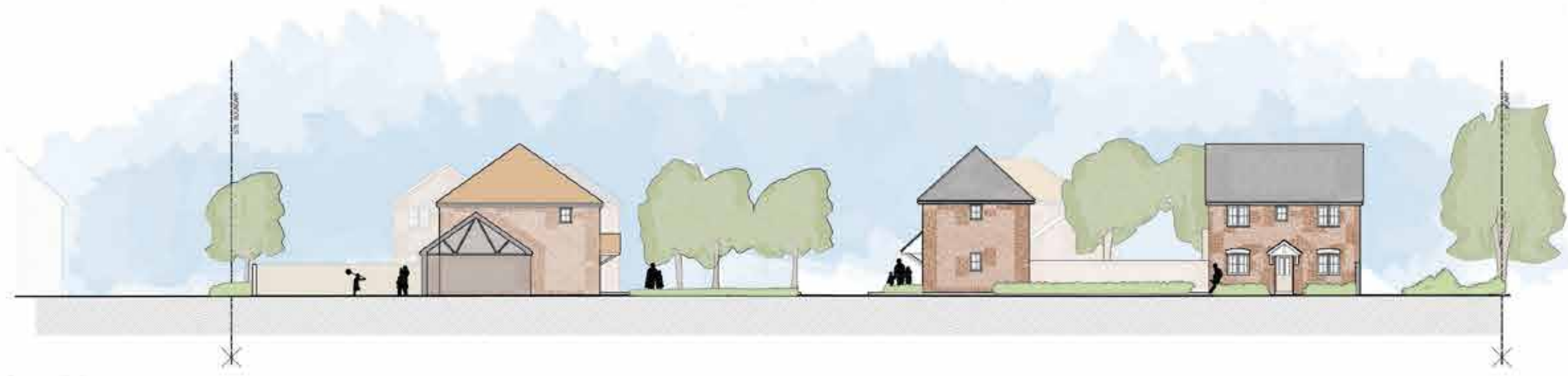
Section B-B Scale 1:200